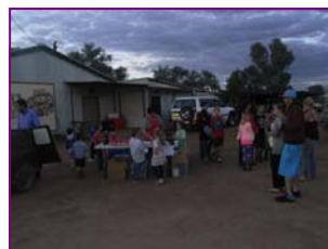
Above: P&C members busy at work.